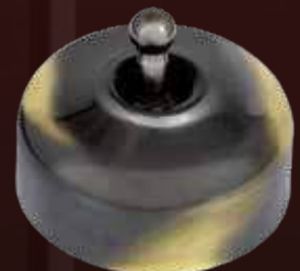
AB - Antique Brass The solid brass covers have been chemically darkened and then relieved so the brass shows through as brass highlights and coated with a clear lacquer.