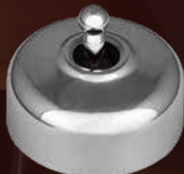
CH - Chrome Solid brass covers have been chrome plated.