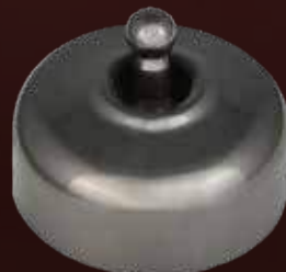
BB - Black Bronze Solid brass covers have been chemically darkened to Black - NO brass highlights and coated with a clear lacquer.