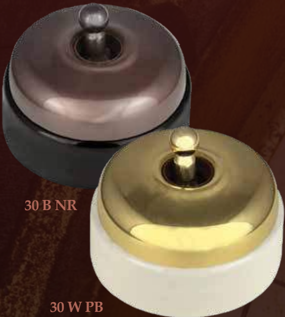
30 B NR