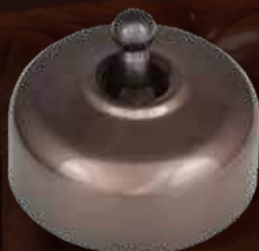
NR - Non Relieved The solid copper covers have been chemically darkened to a rich brown colour - NO copper highlights and coated with a clear lacquer.