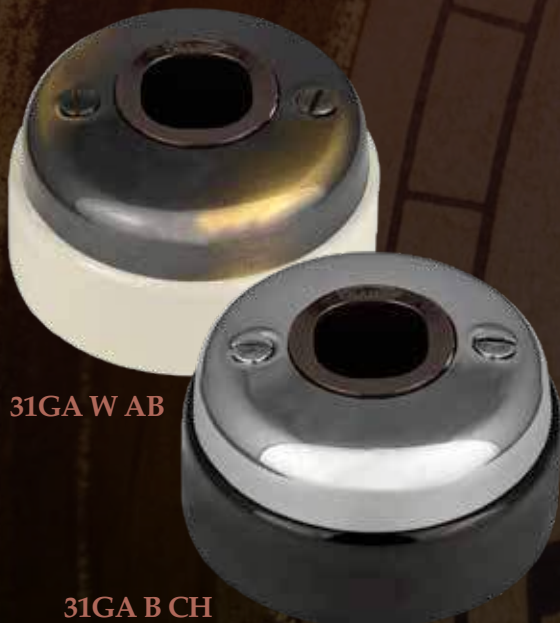
31GA W AB