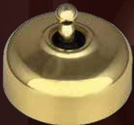
PB - Polished Brass Solid brass covers are polished and coated with a clear lacquer.

Matt finishes also available for PB, AB, BB, FB & NR