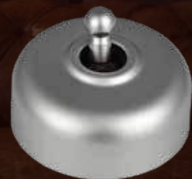
SAT - Satin Chrome The solid brass covers have been chrome plated with a satin finish.