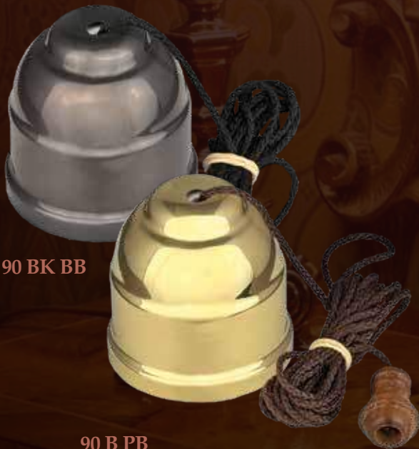
90 B PB