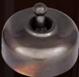
FB - Florentine Bronze The solid copper covers have been chemically darkened and then relieved so the copper shows through as copper highlights and coated with a clear lacquer.