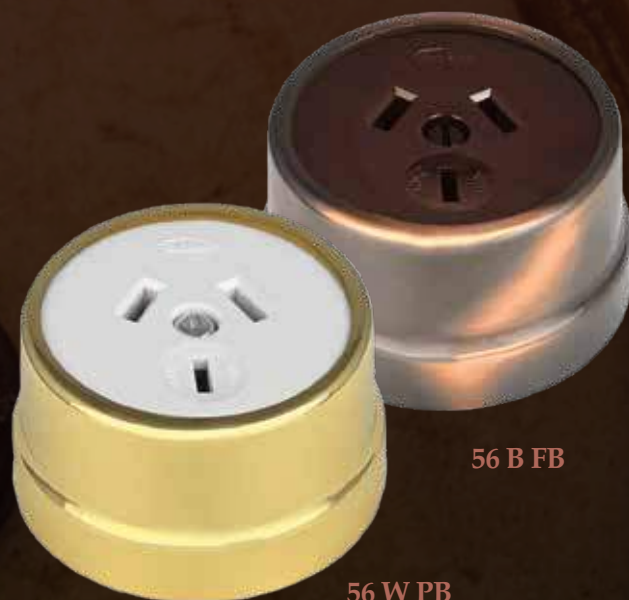
56 B FB

For sockets without metal covers see BAKELITE Series