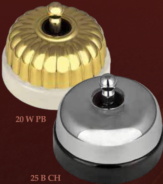
20 W PB