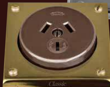
10 SKT B PB