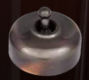
FB - Florentine Bronze The solid copper covers have been chemically darkened and then relieved so the copper shows through as copper highlights and coated with a clear lacquer.