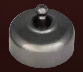
BB - Black Bronze Solid brass covers have been chemically darkened to Black - NO brass highlights and coated with a clear lacquer.