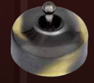
AB - Antique Brass The solid brass covers have been chemically darkened and then relieved so the brass shows through as brass highlights and coated with a clear lacquer.