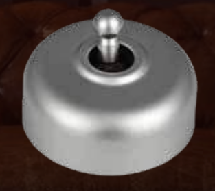
SAT - Satin Chrome The solid brass covers have been chrome plated with a satin finish.