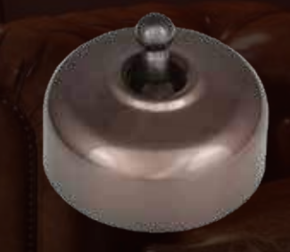
NR - Non Relieved The solid copper covers have been chemically darkened to a rich brown colour - NO copper highlights and coated with a clear lacquer.