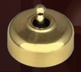
PB - Polished Brass Solid brass covers are polished and coated with a clear lacquer.

Matt finishes also available for PB, AB, BB, FB & NR