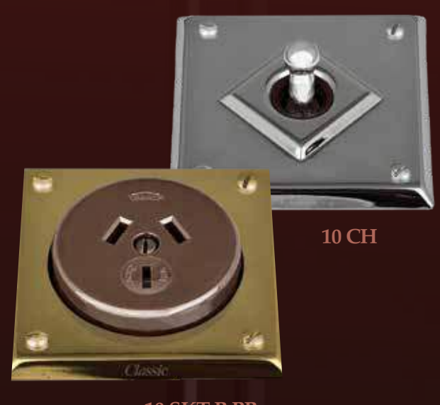
10 SKT B PB