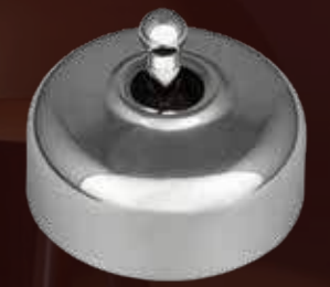
CH - Chrome Solid brass covers have been chrome plated.