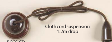
Cloth cord suspension 1.2m drop