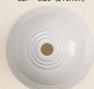
S2W - 8.25" (210mm)