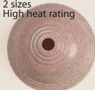
S2P - 8.25" (210mm)