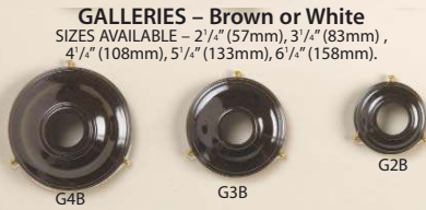
GALLERIES - Brown or White

SIZES AVAILABLE - 2 1/4" (57mm), 3 1/4" (83mm), 4 1/4" (108mm), 5 1/4" (133mm), 6 1/4" (158mm).