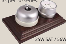
25W SAT / 56W SAT

85 SERIES Federation style deep, smooth push on covers. Available in 6 different metal finishes. 'Matt' lacquer option available. Accessories available as per 55 series.