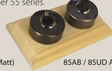
85AB / 85UD AB

VISIT OUR WEBSITE TO VIEW THE COMPLETE RANGE