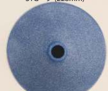
S1B - 9" (228mm)