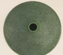
S1G - 9" (228mm)